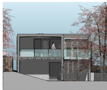
South West Elevation (Rear not shown)