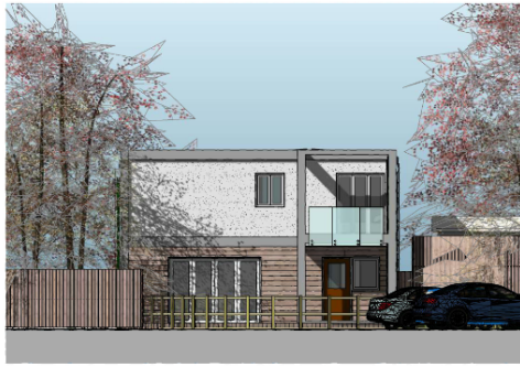
North East Elevation - Side