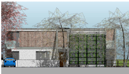
South East Elevation - Front